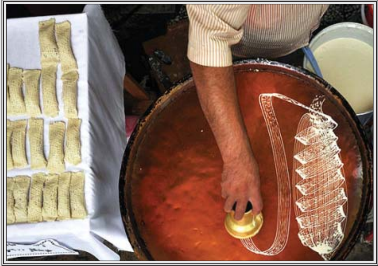
A man is preparing Khoshkar Noodles, a kind of traditional cookies served during Ramadan in northern Province of Gilan.